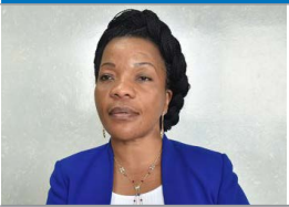
MILAGROSA OBONO ANGUE Minister Delegate of Public Treasury and State Assets