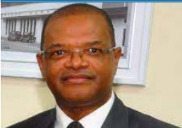
FORTUNATO OFA MBO NCHAMA Minister