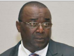
LUCAS ABAGA NCHAMA Minister to the Presidency of the Government in charge of Regional Integration