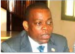
RUFINO NDONG ESONO NCHAMA Minister