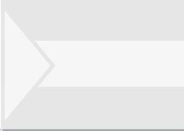
JUAN JOSÉ NDONG TOMO Minister