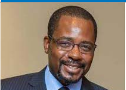
GABRIEL MBAGA OBIANG LIMA Minister Former Minister of Mines and Hydrocarbons