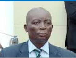
FAUSTINO NDONG ESONO EYANG Minister of State for the Interior and Local Corporations