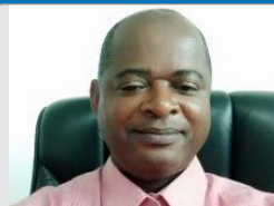
RAMÓN NKÁ ELA NCHAMA Minister Secretary General of the Presidency of the Government