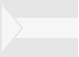
PURIFICACIÓN BUHARI LASAKERO Minister Delegate of Education, Science and College Education