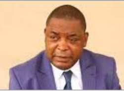
SERGIO ESONO ABESO TOMO Minister