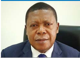
ALFREDO MITOGO MITOGO ADA Minister