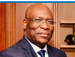
SIMÉON OYONO ESONO ANGUE Minister