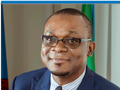
MITOHA ONDO'O AYEKABA Minister