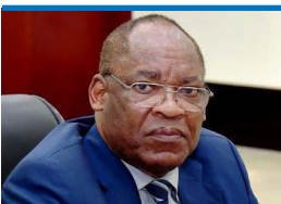
CLEMENTE ENGONGA NGUEMA ONGUENE Minister