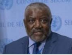
JOB OBIANG ESONO MBENGONO Minister in charge of the Civil Cabinet of the President