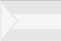
DIOSDADO OBIANG MBOMIO NFONO Minister