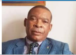
PATRICIO BAKALE MBA Minister