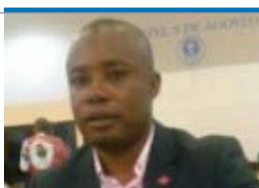
GERVASIO ENGONGA MBA Minister