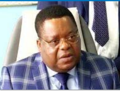
NICOLÁS OBAMA NCHAMA Minister of State in charge of National Security