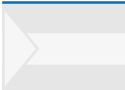
CLEMENTE FERREIRO VILLARINO Minister