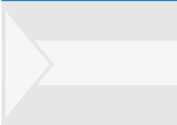
VICTORIANO BIBANG NSUE OKOMO, Minister