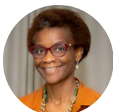
MS. LOUISE PIERRETTE MVONO

Minister of Justice, Keeper of the Seals, in charge of Human Rights