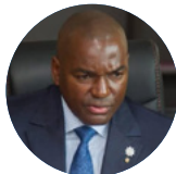
MR. ULRICH MANFOUMBI MANFOUMBI

Minister of State, Minister of Transportation, the Merchant Navy And Logistics