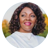
MS. LAURENCE MENGUE ME NZOGHE ÉPSE NDONG Minister of Public Service and Capacity Building