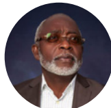
MR. LUBIN NTOUTOUME Minister of Industry and Local Transformation