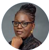
DR. ARMANDE LONGO ÉPSE MOULENGUI

Minister of Social Affairs, responsible for Child and Women's Protection