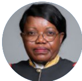
MS. BRIGITTE ONKANOWA

Minister of State, Minister of Transportation, the Merchant Navy And Logistics