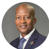
MR. MAURICE ALLOGHO NTOSSUI Minister of Forestry, Environment, Climate, in charge of Human-Wildlife Conflict