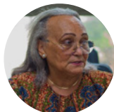
MS. JACQUELINE ILOGUE ÉPSE BIGNOUMBA Minister of Labour, Full Employment, Social Dialogue and Vocational Training