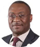
MR. AIMÉ MARTIAL MASSAMBA Minister of Fisheries, the Sea and the Blue Economy