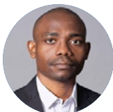
MR. MAYS LLOYD MOUISSI

Minister of the Interior, Security and Decentralization