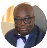
MR. ADRIEN NGUEMA MBA

Minister of the Interior, Security and Decentralization