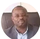
MR. CLOTAIRE KONDJA

Minister of Reform and Relations with Institutions