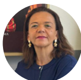
MS. ELZA AYO ÉPSE BIVIGOU Minister of Health