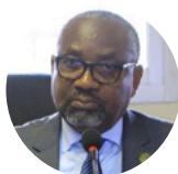
MR. CHARLES EDGARD MOMBO Minister of Higher Education and Scientific Research, Government Spokesperson