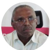
MR. JEAN-FRANÇOIS NDONG OBIANG

Minister of Reform and Relations with Institutions